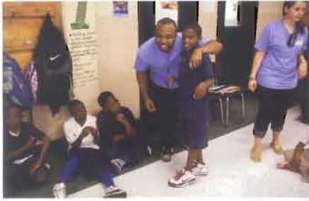
The agency asked noted Time magazine photographer Callie Shell to take pictures of WINGS for Kids as part of its campaign.